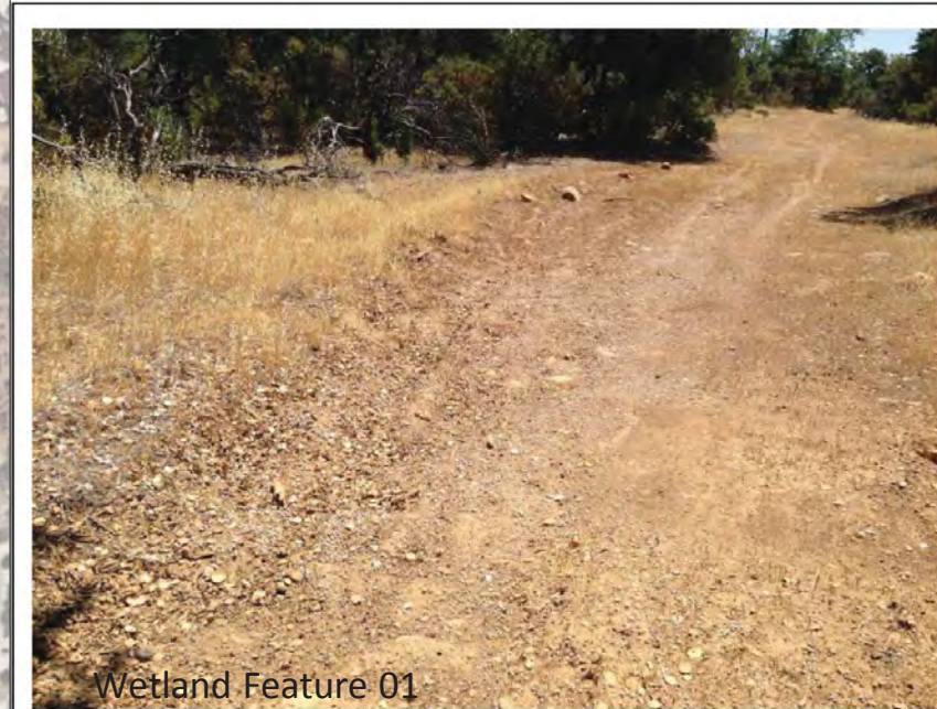
Wetland Feature 01