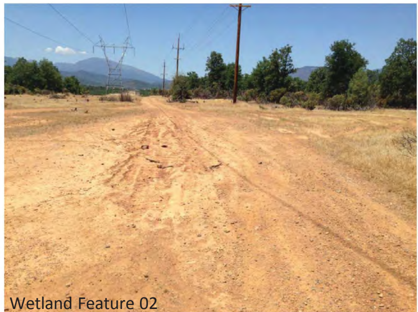
Wetland Feature 02

The features presented in this figure are to be considered preliminary until written verification from the USACE.